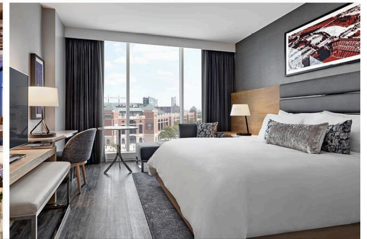
Host Hotel: Live! By Loews ($175 / night)